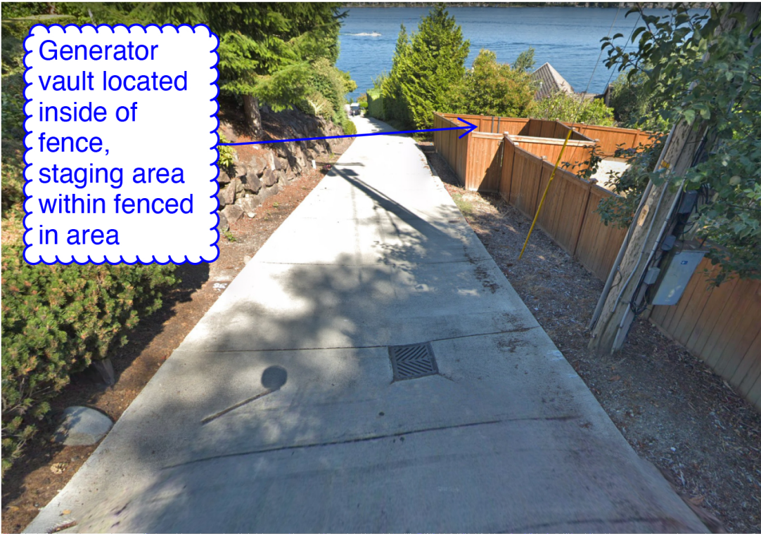
PS 21 – Generator Enclosure (located inside of fence)